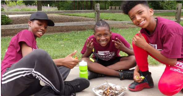
Campers put their fire building skills to the test as they safely create a small flame