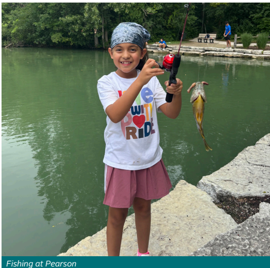
Fishing at Pearson

Mentors accompany 1 to 3 children per week at camp and provide as little or as much support as the individual campers require. This is helpful so that Summer Camp staff can focus on the additional campers.