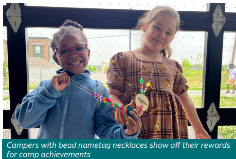
Campers with bead nametag necklaces show off their rewards for camp achievements

This year we started a bead recognition reward program. At the beginning of the week each camper receives a wooden "tree cookie" nametag on a cord necklace. Throughout the camp, campers earn colorful beads for positive behavior, participation, and trying new things. The beads come in fun tiers (Common, Rare, Epic, and Legendary), and every camper proudly displays their camp achievements. The bead system is a fun and inclusive way to recognize all the positive behaviors we love to see, giving everyone a chance to shine, no matter their strengths. It builds camp spirit, encourages teamwork, and gives each camper a meaningful keepsake they can take home and remember their experience all year long. Plus, we get to end each camp day with a bead ceremony full of songs and celebration, allowing campers the opportunity to reflect on their days experiences.