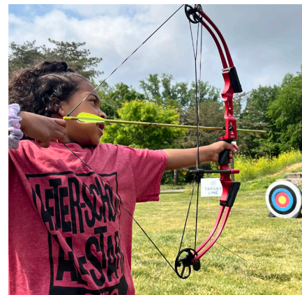
Archery at Side Cut