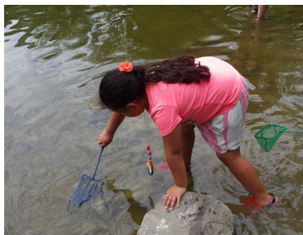
Campers explore river life and macroinvertebrates in the Maumee River at Side Cut

Metroparks staff were very prepared with first aid, sunscreen/bug spray, water, and even sensory items that were immensely helpful for our kids!