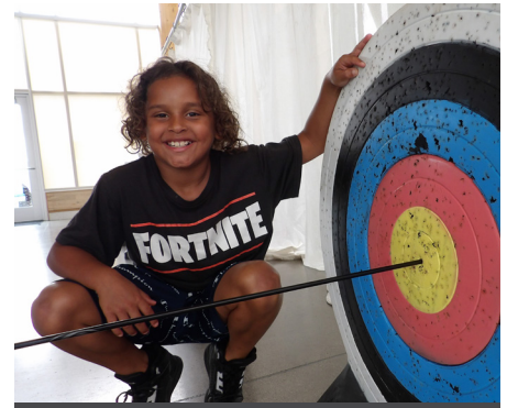
Archery at Glass City

Thank you so much for having us! We look forward to returning again!