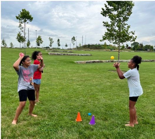
Water balloon toss game at Glass City with reusable water balloons