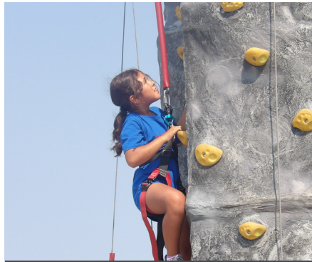
Climbing Wall at Glass City

Every day and activity was well organized and the Metroparks staff were very friendly.