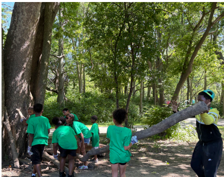
Students work together to build shelter in a survival scenario at Side Cut

Exceeded my expectations. Loved all of it.