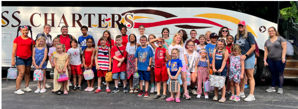
Campers from the East Toledo Family Center gather for a quick photo in front of the bus that brought them to Providence Metropark, ready to kick off a day full of nature, exploration, and fun

Glass City Behavioral Health, Sofia Quintero Art & Cultural Center, SunBridge, Boys and Girls Club, East Toledo Family Center, Catholic Club, Grace Community Center, Magic Moments Daycare, Kiddie Kollege Childcare, Save the Youth, Padua Center, Art Tatum Zone, Believe Center, Unison Health