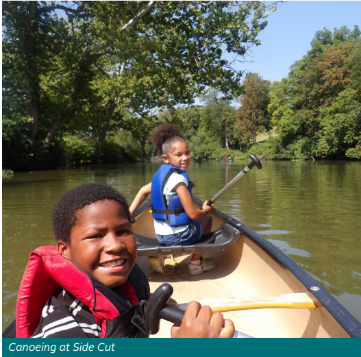
Canoeing at Side Cut