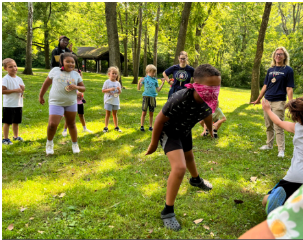
Campers play bat and moth game at Providence learning how they hunt at night using echolocation